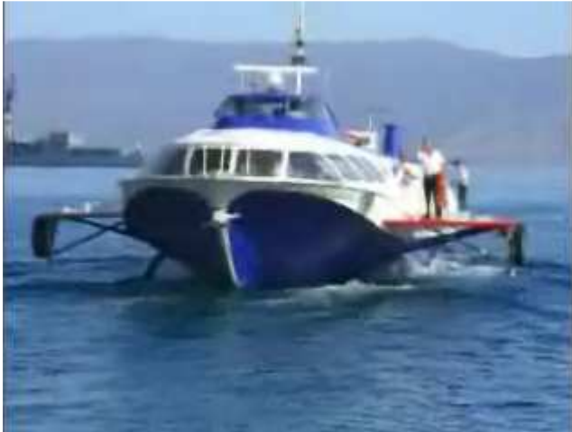
Figure 2: A case of non-essential complementarity : “...we are heading to Patmos...”

the island. Therefore, the image depicts the means through which the narrator is “heading to” the island which is not known through the use of the verb “head to”. In this case, the contribution of the image to the multimedia message is complimentary to the information provided by the speech, though not essential.