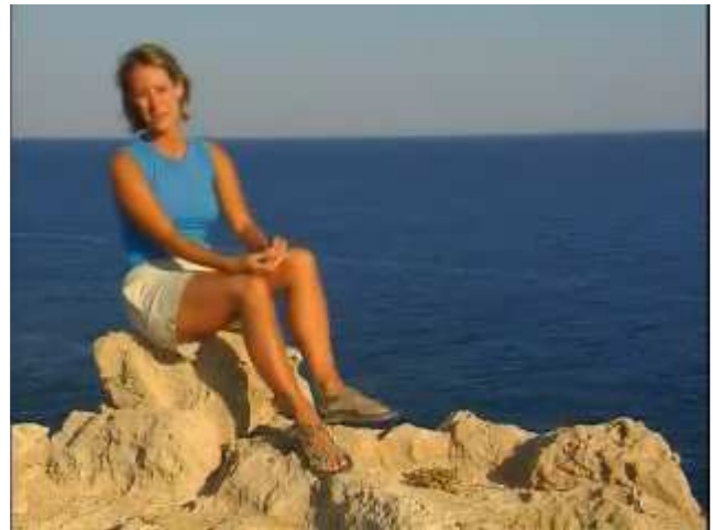
Figure 4: A case of independence : “...I have finally found a place that’s not overrun by tourists...”

Last, figure 4 presents a case of independence . The narrator makes a general comment on the place she has vis-