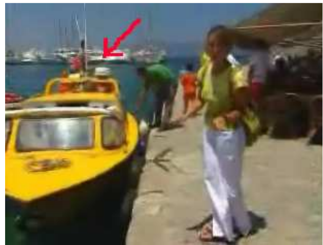
Figure 1: A case of equivalence : “...the yellow taxi-boats...”

In order to further illustrate these multimedia relations, let’s consider the following cases from figures 1 to 4, all of which come from a travel documentary (TV programme in English). Figure 1 depicts a case of equivalence : the narrator refers to yellow taxi-boats that are being used for island hopping in some Greek islands and the corresponding keyframe of the video actually depicts these boats. The image of the boat and the corresponding noun phrase refer to the same entity, the former through visual means, the latter through language.